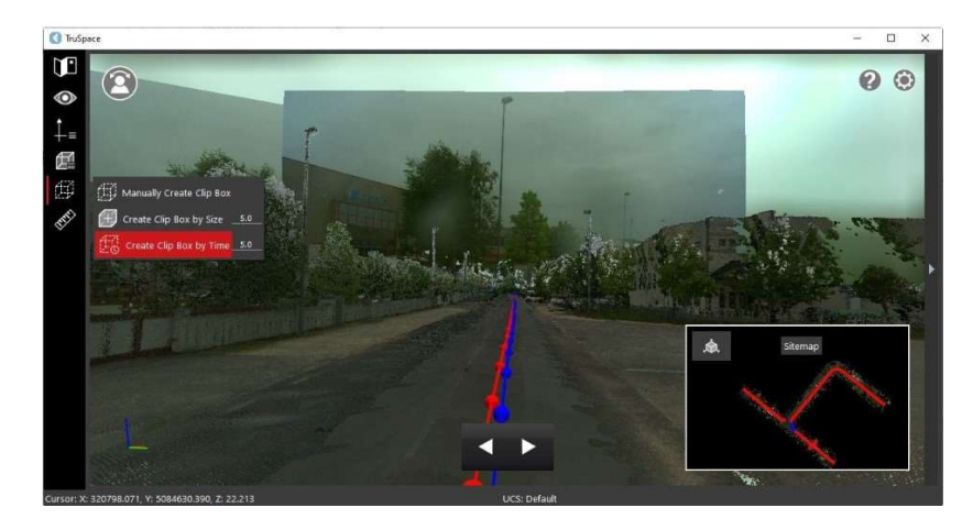
Create a clip by time (seconds)